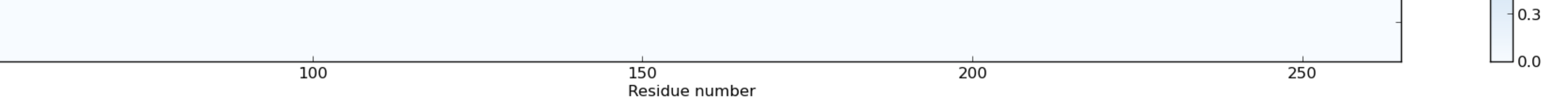
Figure 2. Results of the analysis of the binding site of the \beta 2 Adrenergic Receptor with docked agonists (top) and antagonists (bottom). Differences in binding modes between the two classes of ligands can be easily depicted on the het map of interactions.